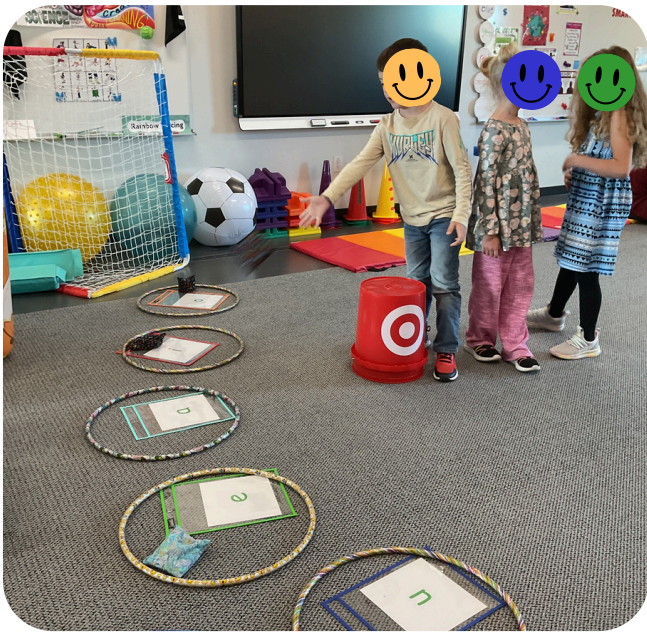
Students identify vowel sounds while practicing hand-eye coordination

Maxine describes S.M.A.R.T. as the building blocks of learning success . This can be seen in the “Cross Patterning” S.M.A.R.T. activity. Cross Patterning integrates both sides of the brain which is essential for a child to read, write, and perform motor movements! Since Cross Patterning can be done while walking, it is a great activity that students can practice during transitions to the classroom and playground, or with music which the children love!